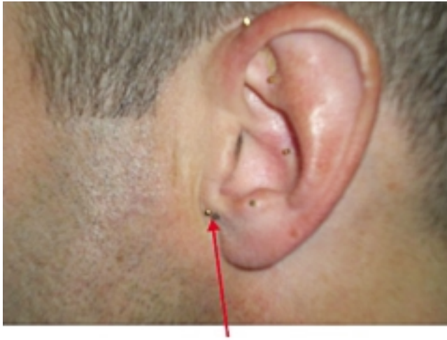
FIG. 1. Arrow delineates 1 gold and 1 stainless steel ASP needle just touching each other at the Cingulate Gyrus Zone.

Niemtzow postulates from observations that the addition of a second ASP needle of a dissimilar metal (stainless steel or silver) just touching the gold ASP needle will produce a small ionic current flow. This system may act like a micro-electrical stimulator to the “acu-zone” (Figure 1).